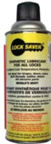
60601 Synthetic Lubricant 12.65 fl oz