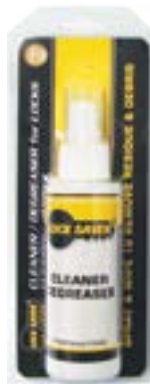
60441 Cleaner in Pump Spray 4oz