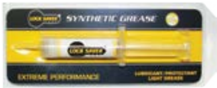
60151 Grease Syringe 0.5oz

Lock Saver® super-lubricates lock mechanisms and leaves parts clean and corrosion-resistant. Since its introduction to the security hardware industry in 2005, Lock Saver® has quickly become the new standard of excellence for lock maintenance - especially effective in harsh climates and extreme temperature environments. Lock Saver® also eliminates galvanic corrosion in those areas where dissimilar metals come into contact with each other.